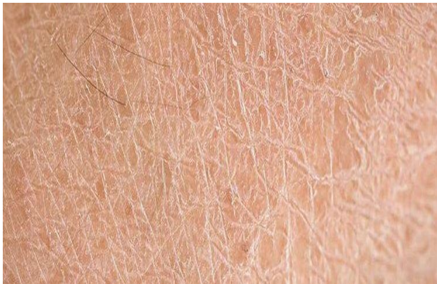
Figure - 1: Xerosis

(33.33%) was the most common finding. Regarding Hair changes, dry lusterless hair (28.33) was common. (Table IV).