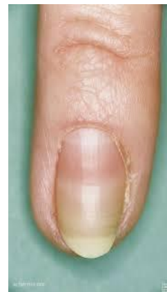
Figure - 3: Half and Half Nail