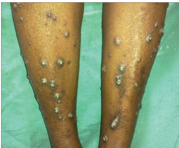
Figure - 2: Acquired perforating dermatosis