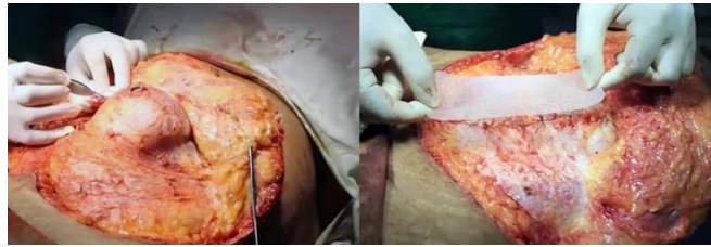
Figure - 2: Dissection and exposure of hernial sac and intraoperative placement of polypropylene mesh over the abdominal wall during hernioplasty

most common, occurring in 5 patients (16.7%), which is consistent with expected outcomes in abdominoplasty-based surgeries involving large tissue planes. Wound infection was noted in 3 patients (10%), all of which were managed conservatively without requiring reoperation. A single case (3.3%) of minor wound dehiscence was reported, also resolving with routine wound care.