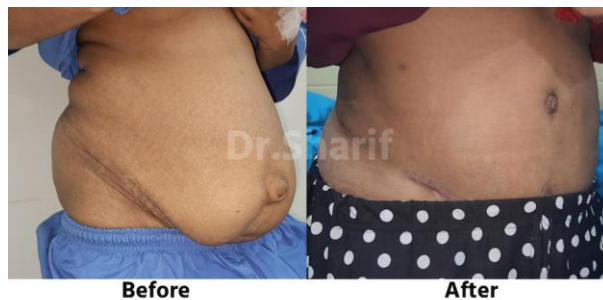
Figure - 4: Dramatic contour improvement and umbilical realignment post lipo-abdominoplasty with ventral hernia repair