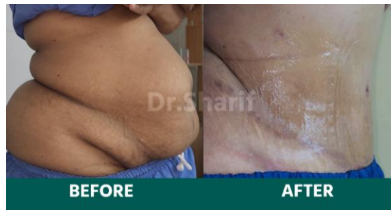
Figure - 3: Preoperative and postoperative comparison following ventral hernioplasty with lipo-abdominoplasty on a female patient