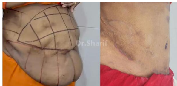
Figure - 5: Preoperative marking and final result after 360° lipo-abdominoplasty with ventral hernia repair